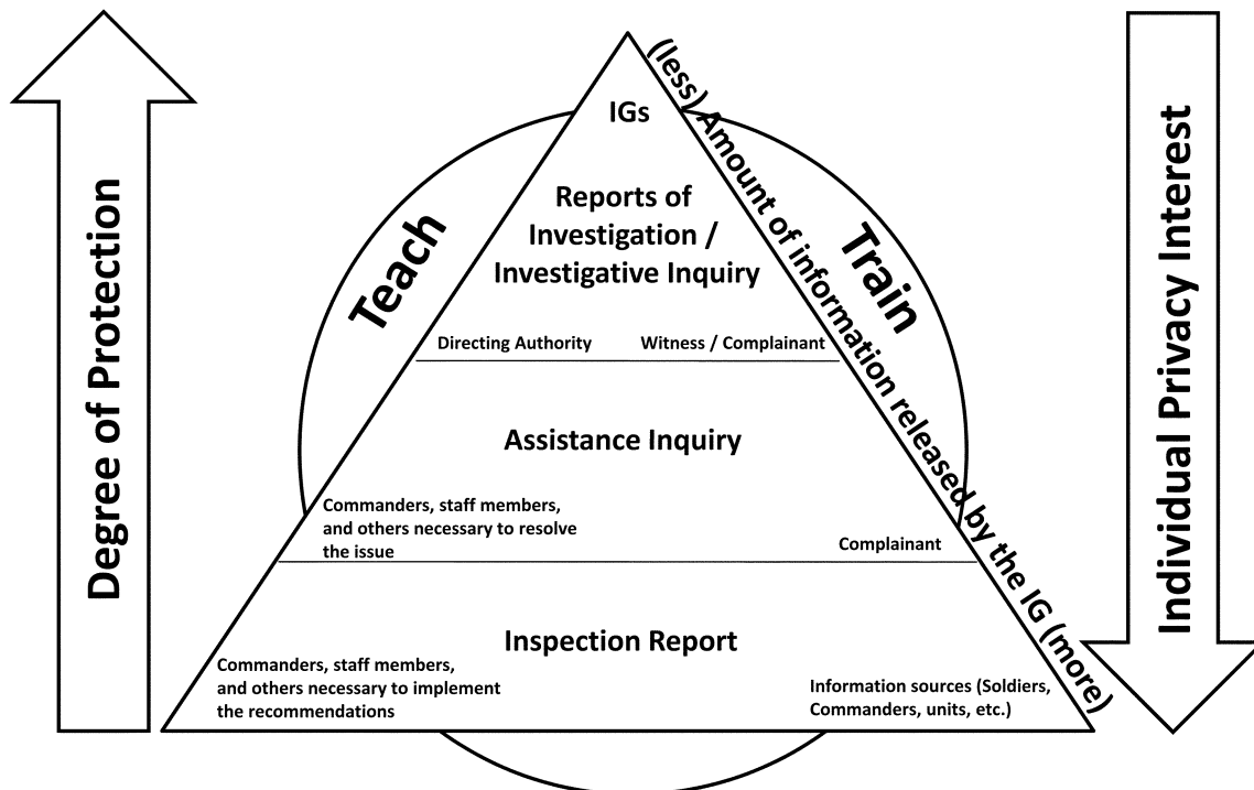
Figure 1–1. Triangle of confidentiality

g. The triangle of confidentiality. A helpful notion to understand confidentiality is through the model known as the triangle of confidentiality (see fig 1–1, below). The triangle contains three parties—the commander, the complainant (or person providing information to an IG), and the IG—and is an extension of the commander-IG relationship. In general, IGs may share the most sensitive, attributable IG information within the triangle, although the IG is under no obligation to reveal sources if they are not pertinent to the issues or topics under consideration. The third person in the triangle—the complainant or person providing information to the IG—is normally allowed to know only those things that directly affect him or her and no more.